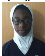
Tezkiyah Head Girl