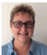
Ms Priddle Cover